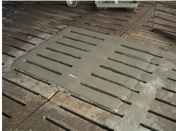
Concrete repair with Plastifloor® acrylic resin mortar.