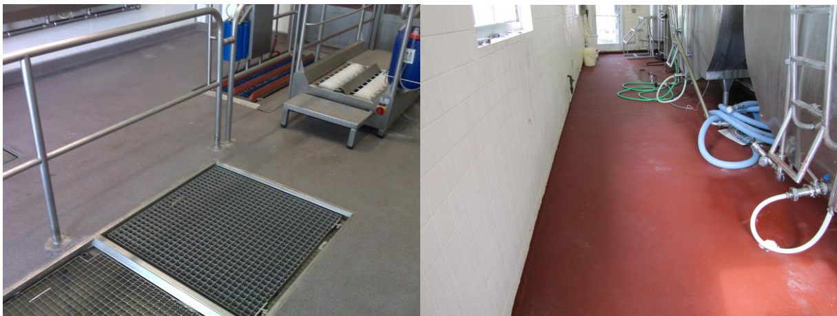
Hygiene sluice and milk storage.